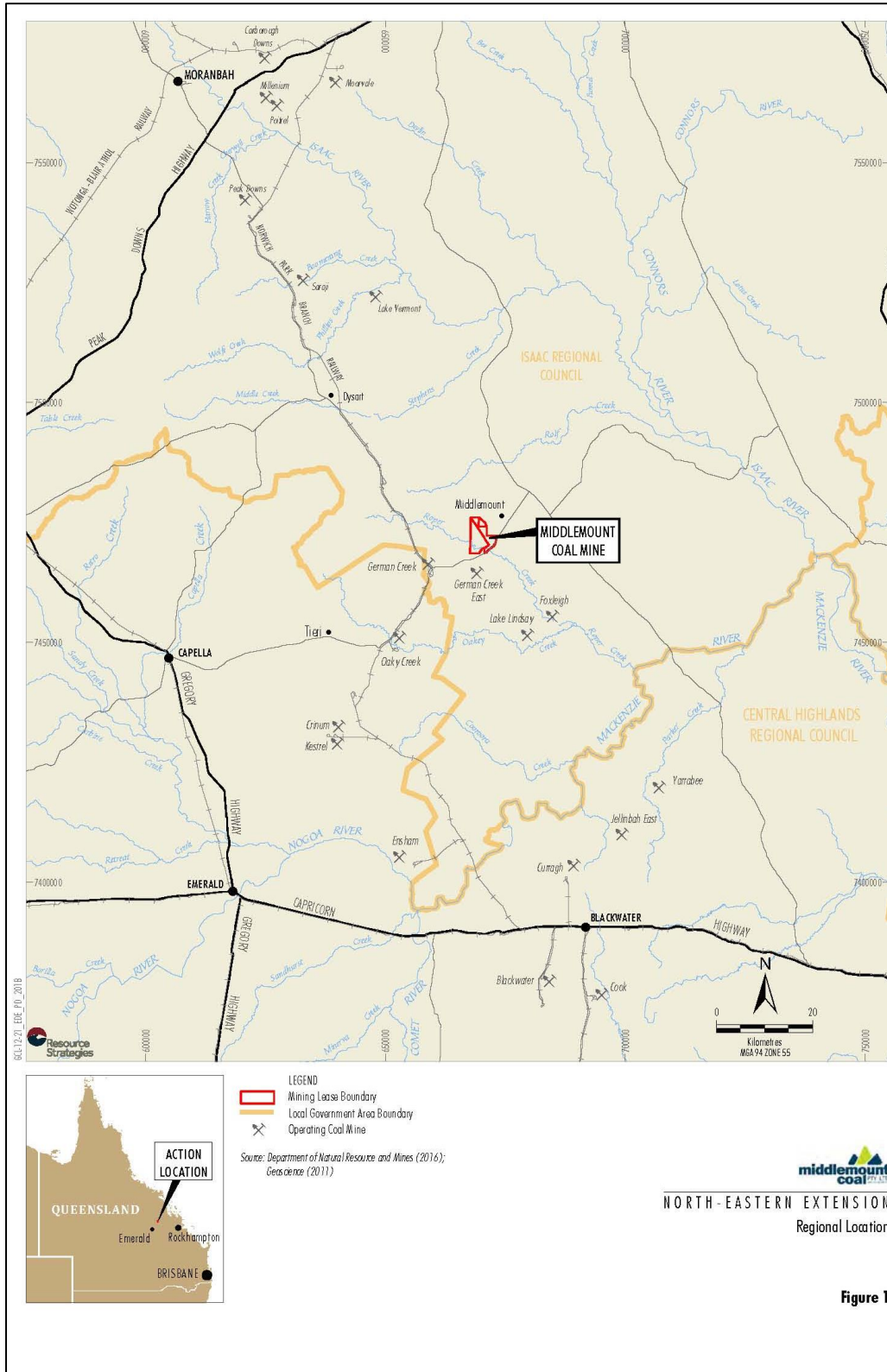
Figure 1: Regional Location of Middlemount Coal Mine